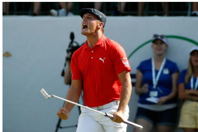
2017 Champion, Bryson DeChambeau