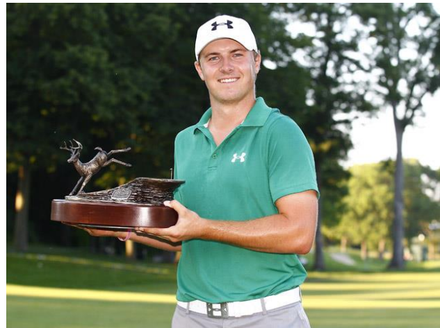
2-time John Deere Classic Champion, Jordan Spieth