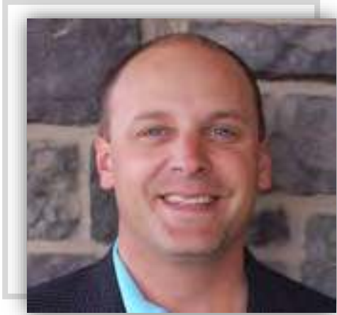
Director of Golf Course Maintenance