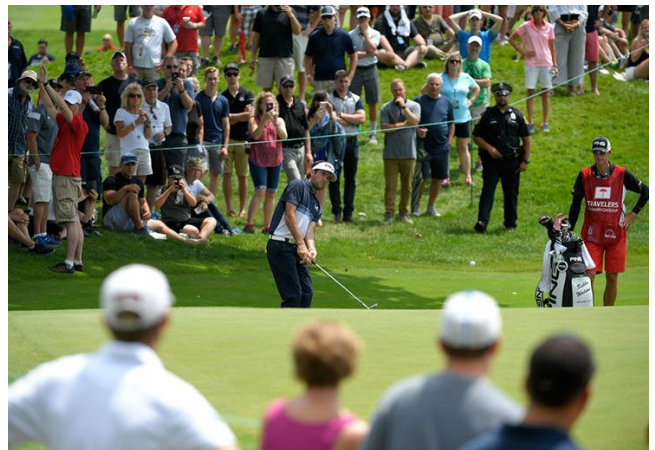
The 2018 Travelers Championship hosted at TPC River Highlands