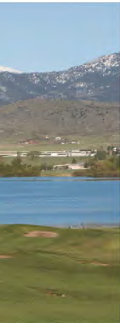
TPC Colorado marries Scottish elements—fescue-lined fairways with pot bunkers—with Colorado scenery.