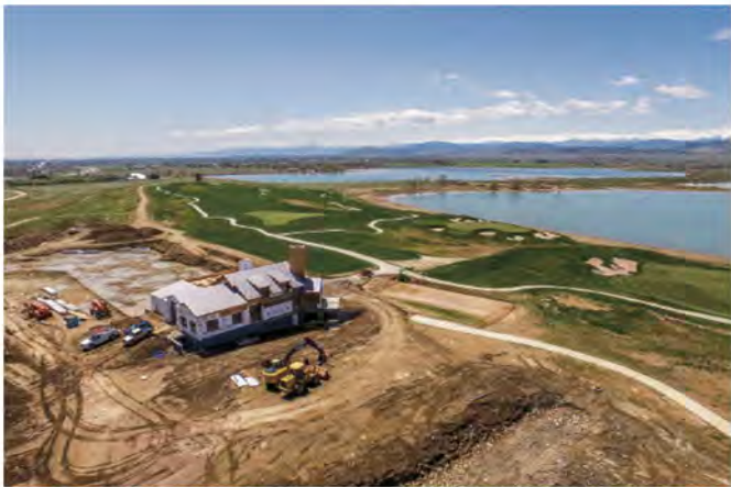
Phase 1 of the clubhouse includes construction of an 11,000 square-foot building that will include a pro shop and bar and grill. Phase 2 will be connected to the south and will encompass an additional 50,000 square feet.

of the condition of the golf course, I think it's going to be a win."