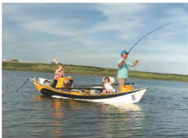
World-class fishing at Heron Lakes.

to outdoor activities. In addition to fishing and hunting, there will be access to walking, hiking and biking trails that span over 8 miles.